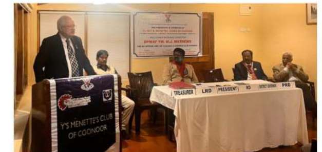
Visit to Coonoor Club