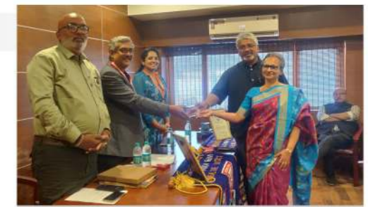
Charter Meeting of Bangalore Club