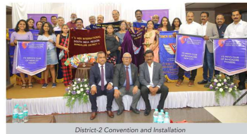
District-2 Convention and Installation