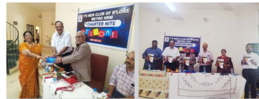
Charter Meeting of Metro Club