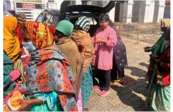
Feeding the poor at Coonoor - Every Tuesday

This poem is about a big characteristic in our life with an ironically small spelling-ego. It influences our lives, our moods and most importantly our relationship with people around us. The poem explains how vanities and ego are wasted and the cause for most misunderstandings. Sadly, too much of this ego is seen in our movement recently. Instead, in the little time we have here, we should look to bury our egos and try to laugh more, help one another, nurture our planet and be of service as much as possible.