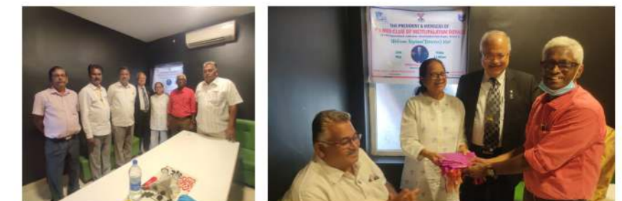
Visit to Mettupalayam Royals