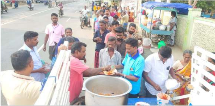
Feeding the poor at Tiruppur - Every Sunday