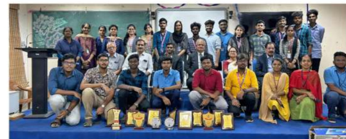
Visit to GCT Youth