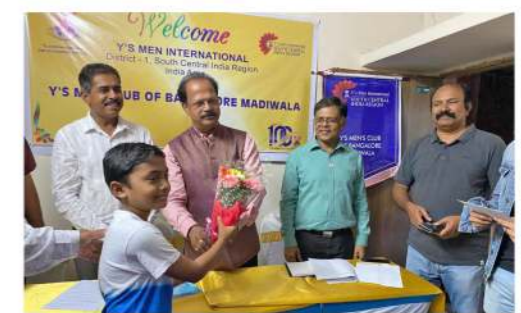
DG visit to Madiwala Club